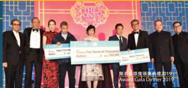
無名英雄獎頒獎典禮2019 Award Gala Dinner 2019